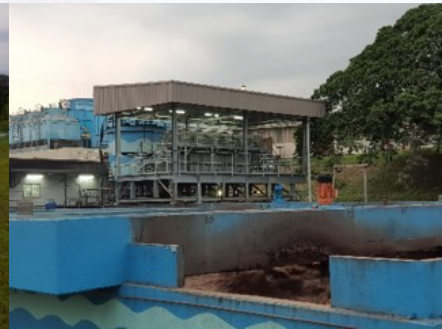
● Food Processing