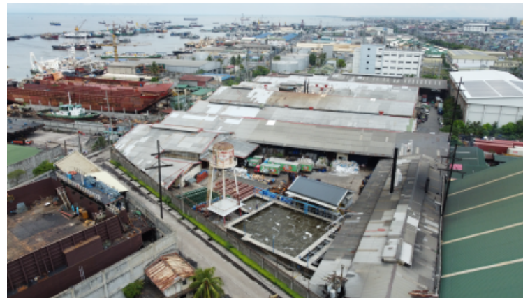
1,680 m 3 /d Canning Plant, Manila