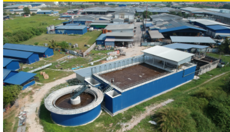
2,000 m 3 /d Chicken Processing Plant , Malaysia