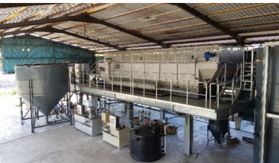
● Fishball Processing