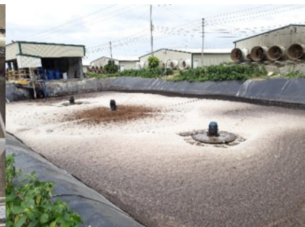
● Livestock Farming