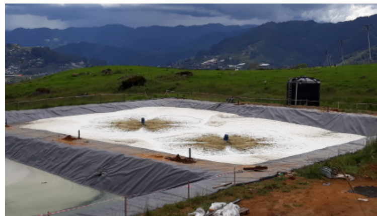
100 m 3 /d Cattle Farming, Malaysia