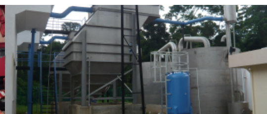
Inclined Plate Clarifier