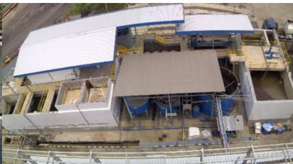
● Palm Oil Refinery