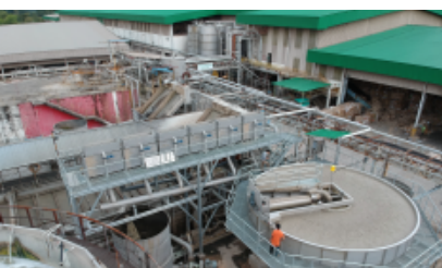
19,200 m 3 /d Paper Mill, Malaysia