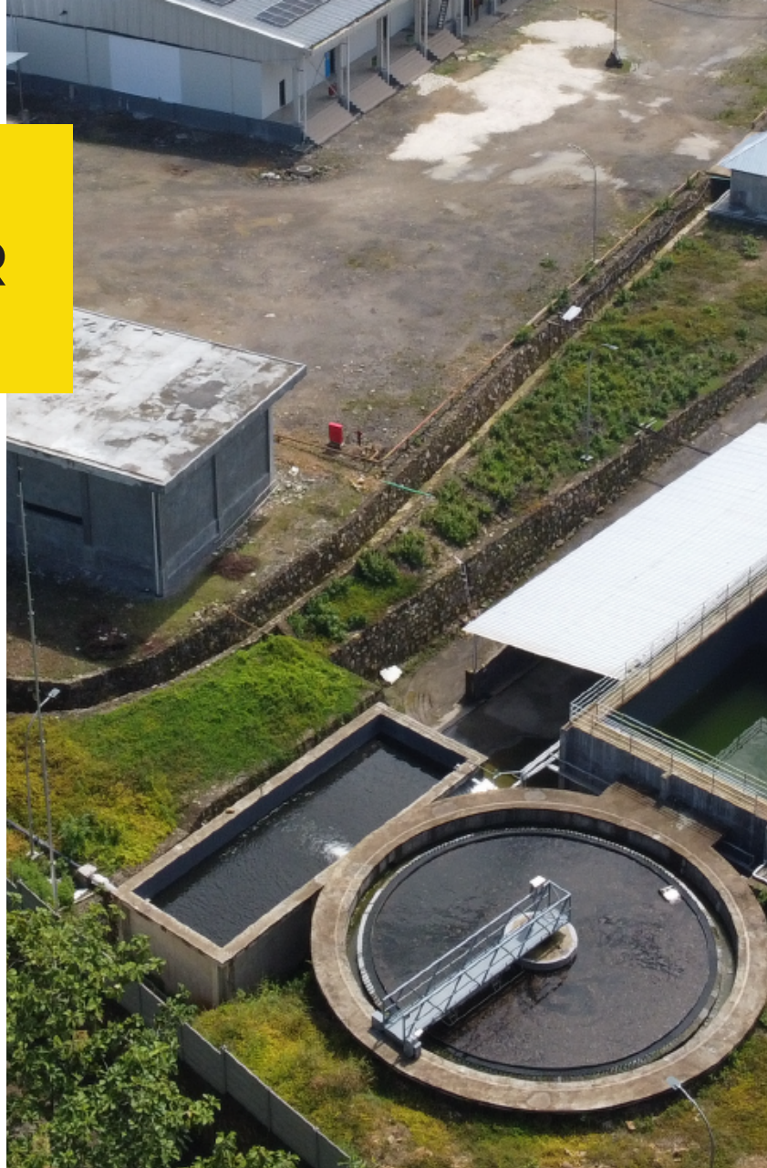
8,000 bph Chicken Processing Plant, Indonesia

A careful analysis of industrial process, wastewater streams and composition of industrial waste water is essential. Pilot plant studies, sample testing in our own laboratory and the use of onsite test units in preliminary stage are used to produce a system that ensures performance.