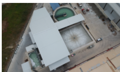
3,500 m 3 /d Rubber Glove Plant, Malaysia