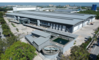
1,000 m 3 /d Food Processing Plant, Malaysia